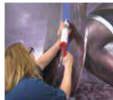
Tape and Apply Silicone