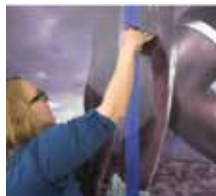
Smooth it out