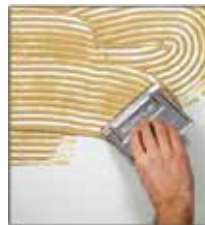
Spread adhesive over the back of the panel.