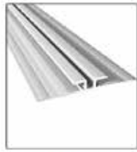
Square Channel F568