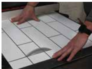
FRP Panels are easily trimmed on a table saw.