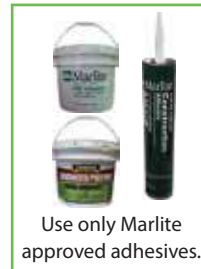
Use only Marlite approved adhesives.