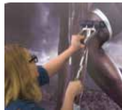
Roll panel after installation.